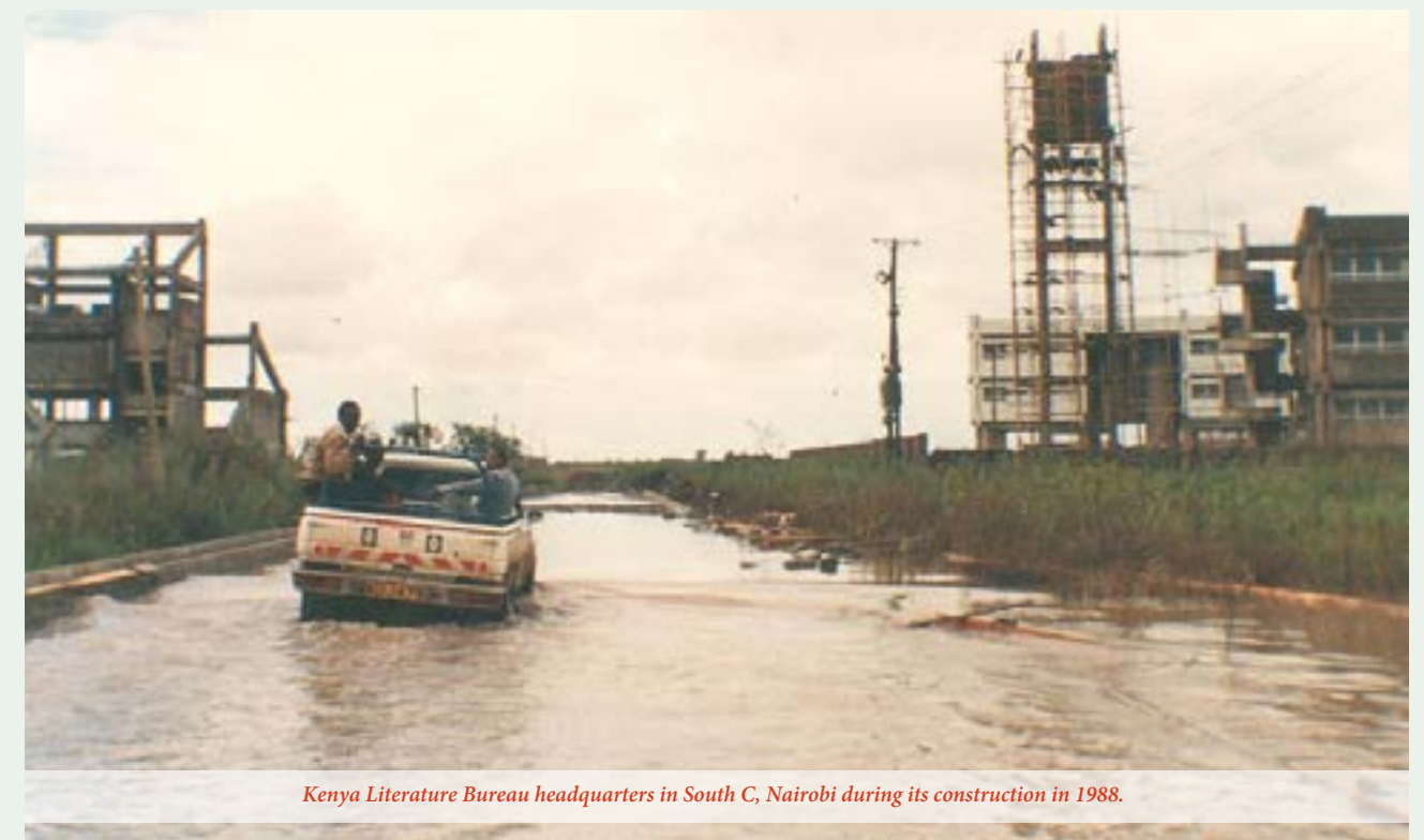
Kenya Literature Bureau headquarters in South C, Nairobi during its construction in 1988.