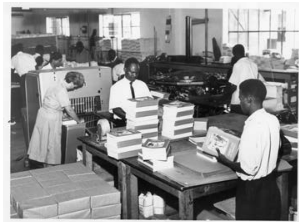
Workers of the East African Literature Bureau (EALB) at Central Printing Press

At the time, Richards described EALB as the "single integrated organisation attacking the problems of production and distribution