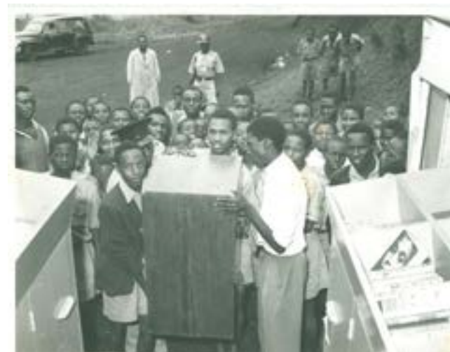
The Books Box Service of East African Literature Bureau (EALB) delivering books at a village in Uganda territory

The brain power behind EALB's formation, Mrs Huxley, was an author, journalist, broadcaster, magistrate, environmentalist, farmer and government adviser. Born in the UK and raised in Thika, Mrs Huxley worked as a broadcaster for the BBC during the Second World War, the Advisory Commission for