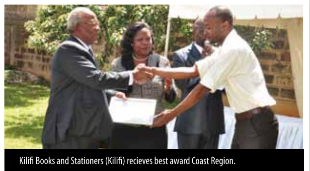
Kilifi Books and Stationers (Kilifi) receives best award Coast Region.