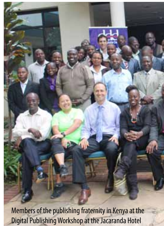
Members of the publishing fraternity in Kenya at the Digital Publishing Workshop at the Jacaranda Hotel