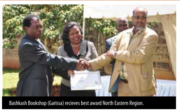
Bashkash Bookshop (Garissa) receives best award North Eastern Region.