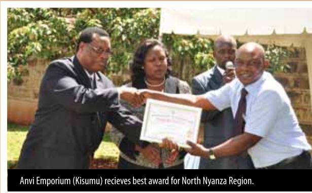
Anvi Emporium (Kisumu) receives best award for North Nyanza Region.