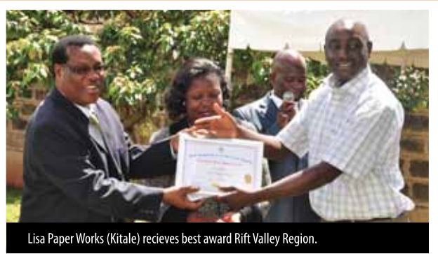
Lisa Paper Works (Kitale) receives best award Rift Valley Region.

In Western Region, Mega Bookshop (Bungoma) was the best improved, Fulchand Bookshop (Kisumu) in North Nyanza Region, Ustawi Bookshop (Garissa) in North Eastern Region, Kabarú Bookshop (Murang'a) in Central Region and Maam Bookshop in South Nyanza Region.