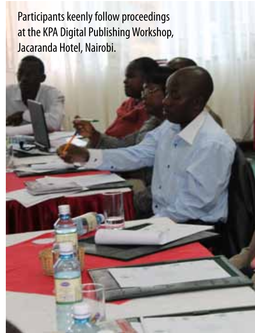
Participants keenly follow proceedings at the KPA Digital Publishing Workshop, Jacaranda Hotel, Nairobi.

Meanwhile, the Publishing fraternity assembled at Jacaranda