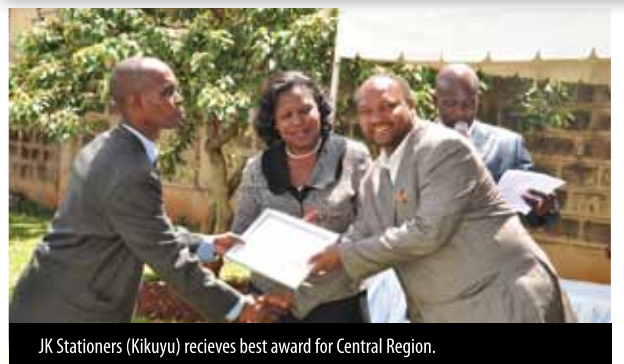
JK Stationers (Kikuyu) receives best award for Central Region.