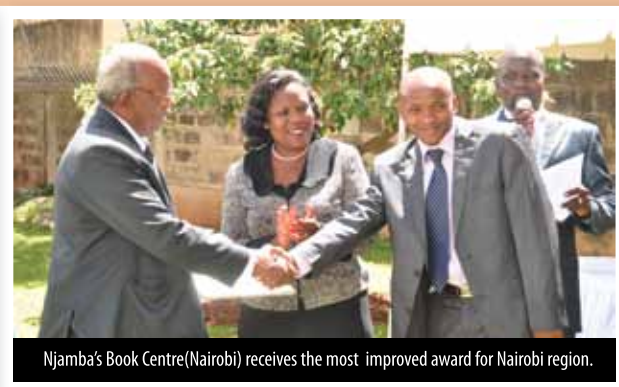
Njamba's Book Centre (Nairobi) receives the most improved award for Nairobi region.