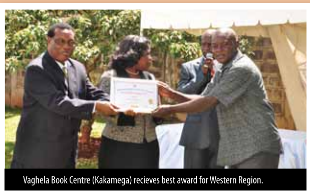
Vaghela Book Centre (Kakamega) receives best award for Western Region.

She disclosed that the Bureau will maintain its strategic focus in the coming year to sustain the current growth momentum.